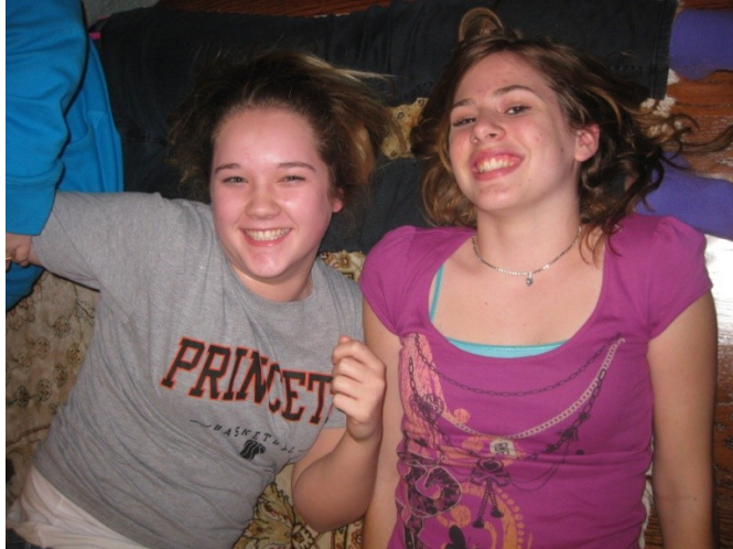
The Plunge Youth Group having fun at the Rocky Hill Parsonage. See article on page 10 for more information.