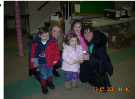
Ice and snow did not keep families away from the February 5 Open House

We are currently enrolling students for the 2011-2012 school year. If you are interested in a placement, please contact the school so we can be sure church members receive priority placement. The school will be offering classes for students 2 - 6 years old.