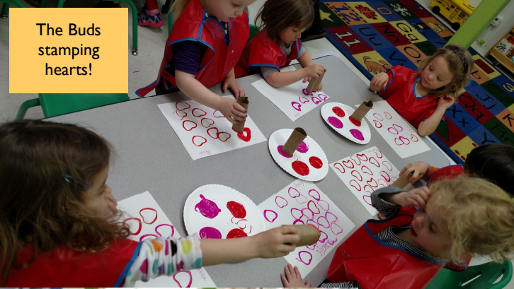
The Buds stamping hearts!