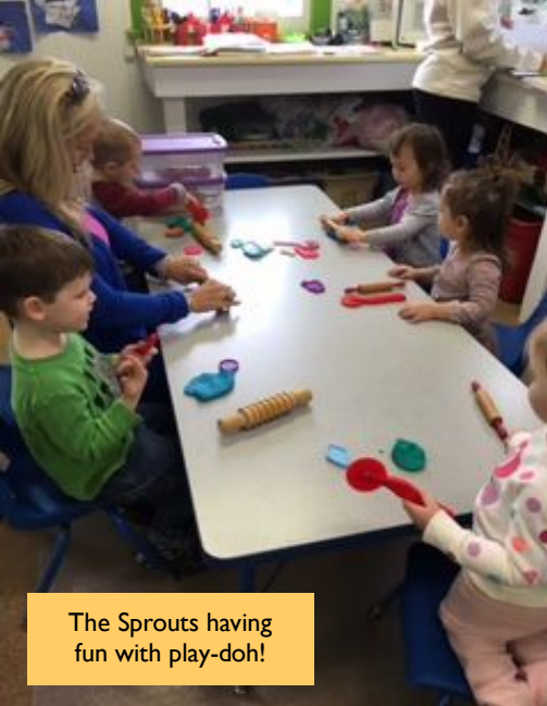
The Sprouts having fun with play-doh!