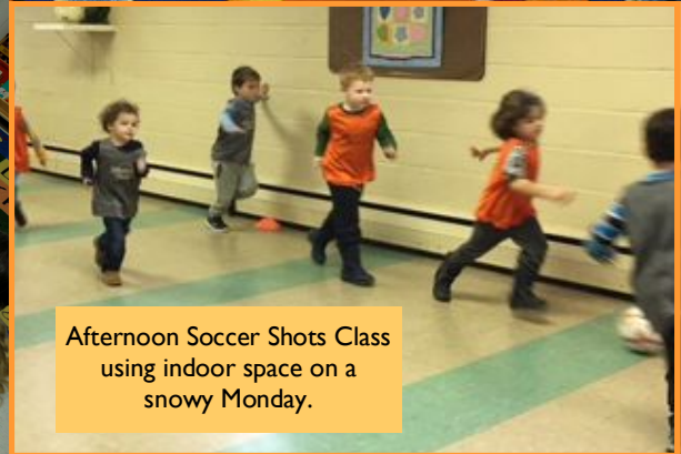
Afternoon Soccer Shots Class using indoor space on a snowy Monday.