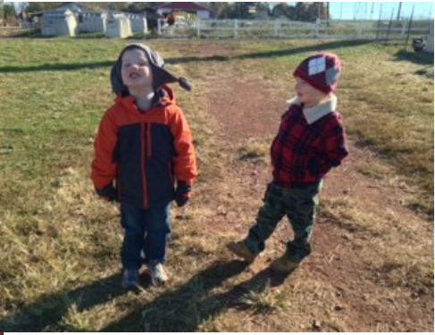
BVS Annual Trip to the Farm