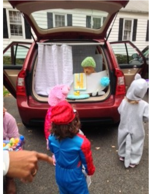
♪ Splish splash we were taking a bath ♪