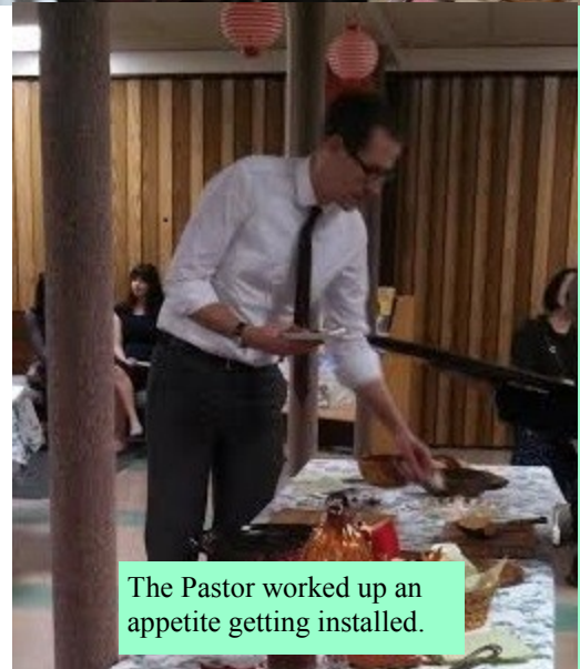
The Pastor worked up an appetite getting installed.