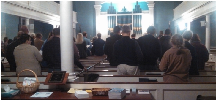
The Classis at worship after dinner.