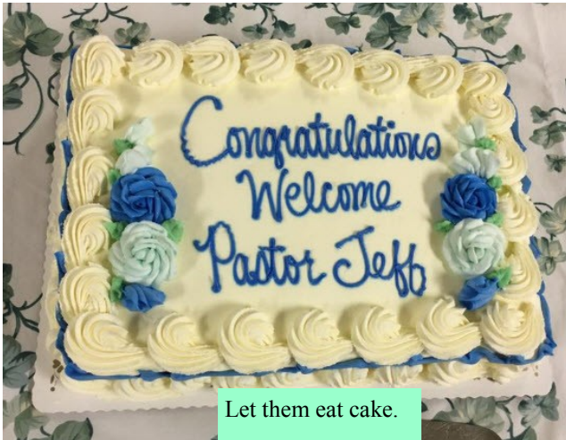
Let them eat cake.