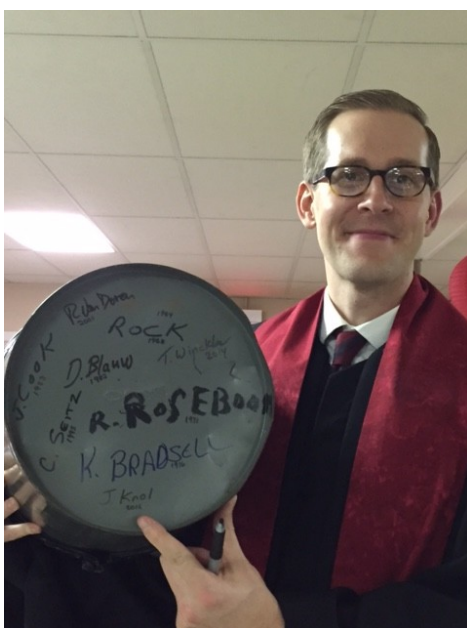
BRC tradition— signing the pastor's trash can