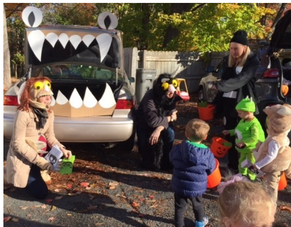
Trunk or Treat 2016