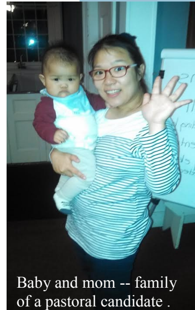
Baby and mom -- family of a pastoral candidate .

In honor or memory of (please circle one) _____