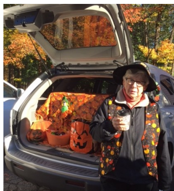
Bernice's Pumpkin Patch