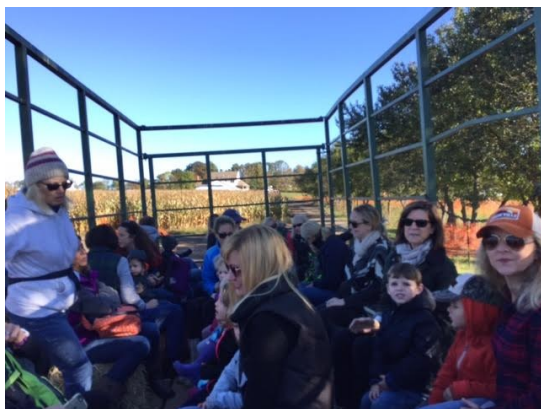
Norz Hill Farm - October 14th Hayride, pumpkin picking