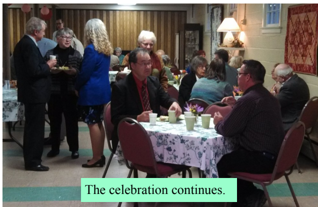
The celebration continues.