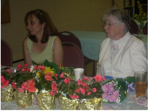
A thank-you lunch given by BVS Trustees for BRC and BVS staff and supporters.