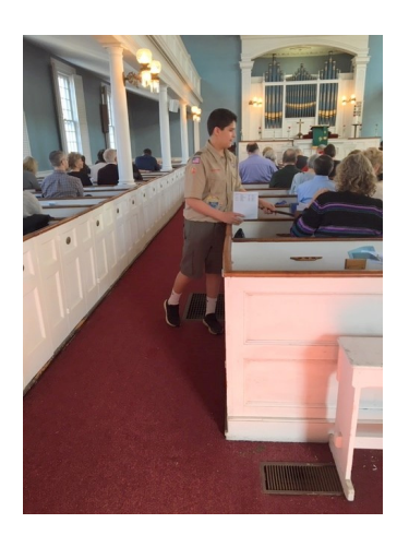
and collected offering.