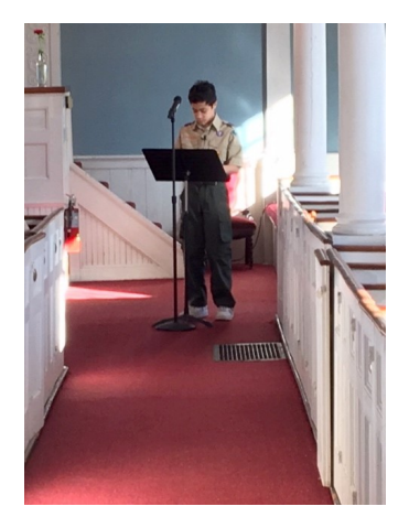
led the Scout Law Litany,