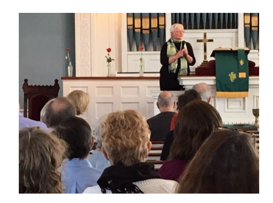
received thanks and appreciation from the church,