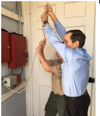
rang the bell,

Scout Sunday, February 17 - The boys participated in the worship service. They. . .