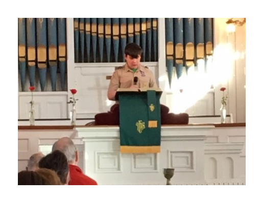
read the scripture,