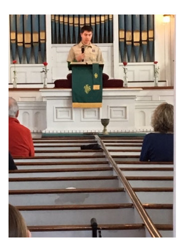
shared scout activities,