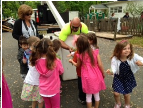
St. Jude's Trike-a-Thon Township Touch-a-Truck