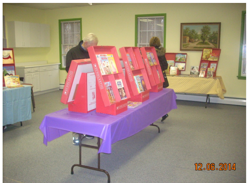
BVS Scholastic Book Fair

This is a great way to have a few hours to yourself while your child is in a fun safe environment with certified teachers. Cost is $20.00 for an afternoon session. Enrollment is limited so please call (609-466-6600) to check availability.