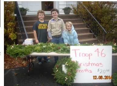
Troop 46 selling wreaths at Sinterklaas

Troop 46 donated 6 wreaths for our doors.