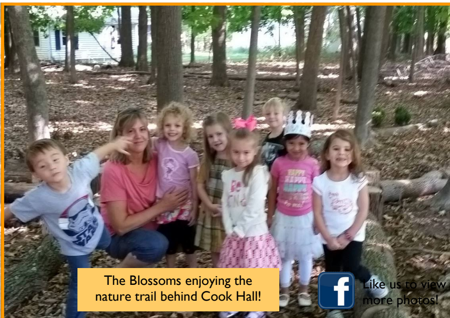
The Blossoms enjoying the nature trail behind Cook Hall!

There are limited openings available in some programs for the 2015-2016 school year. If interested, please call 609-466-6600 or send an email.