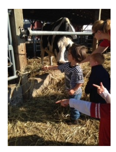
We visited Norz Hill Farm where we learned about many farm animals, took a hayride and picked our own pumpkins and gourds.