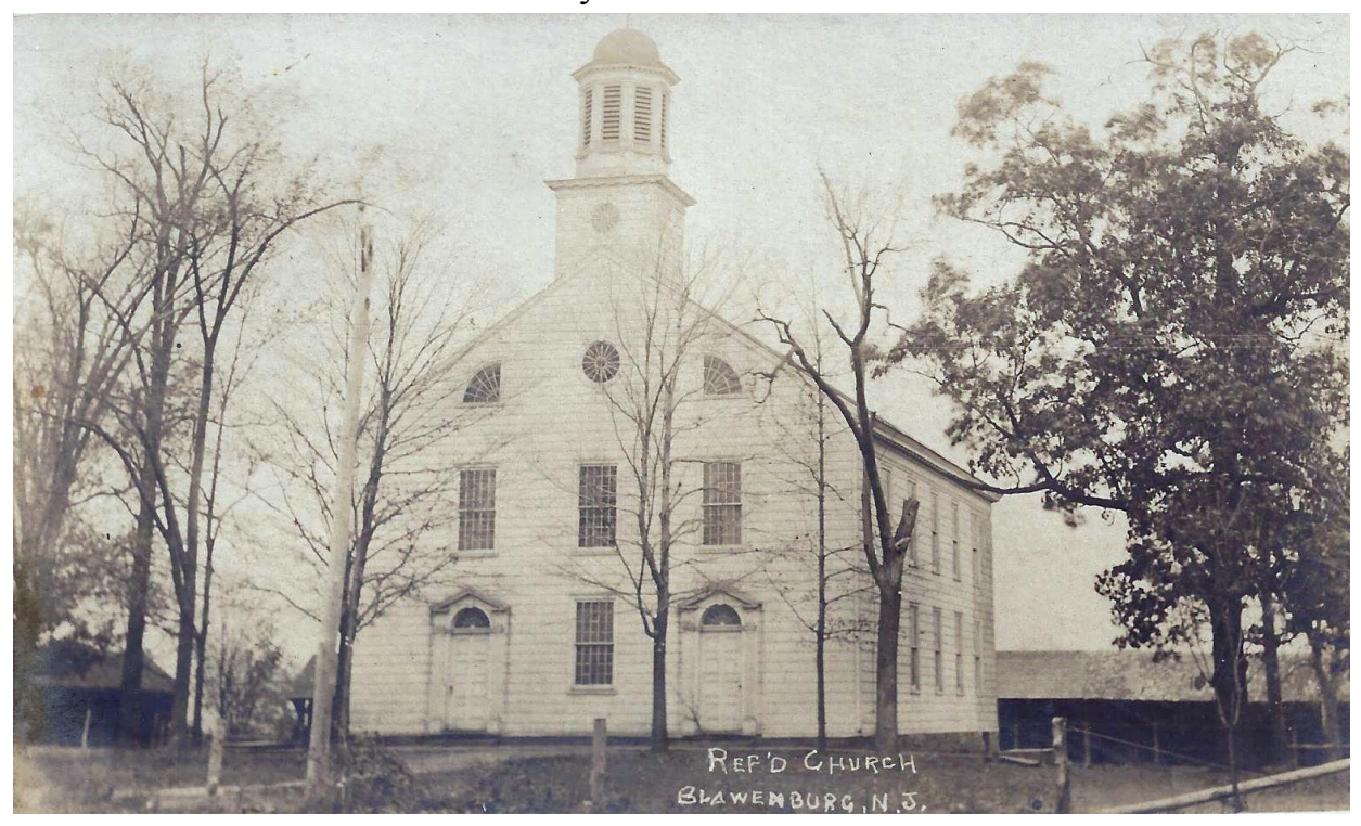
The Way We Were and Are

In the great purge and reorganization of church files that recently took place, Ethel Terhune found this postcard of the church from around 1900. It is a rare find because it shows the old sheds behind and beside the church where the horses and buggies were kept during church services. Note the posts close to the road. Were they part of a fence or hitching posts for the horses? The church looks the same, but most importantly, its mission and message remain the same – to love God and love our neighbors.